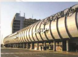
VIB Hall – Cairo AirPort