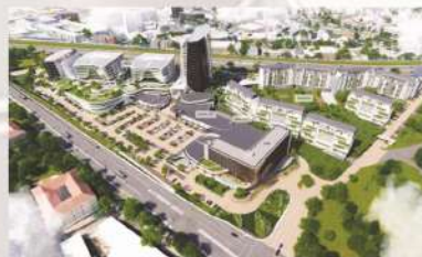
R3 - Mixed Use Buildings