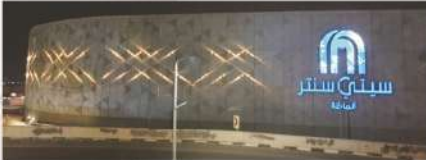
GALAXY – ALMAZA MALL