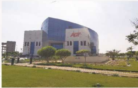
SMART VILLAGE - ACT