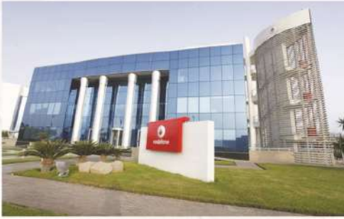
SMART VILLAGE - VODAFONE